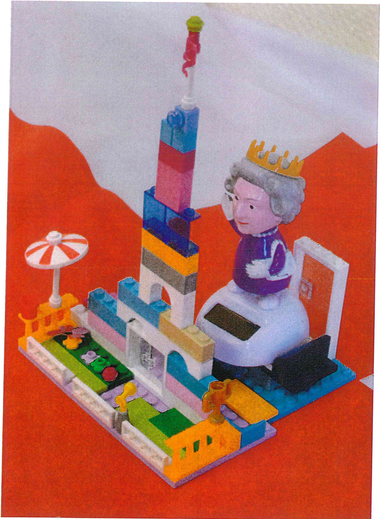
She is in the castle.