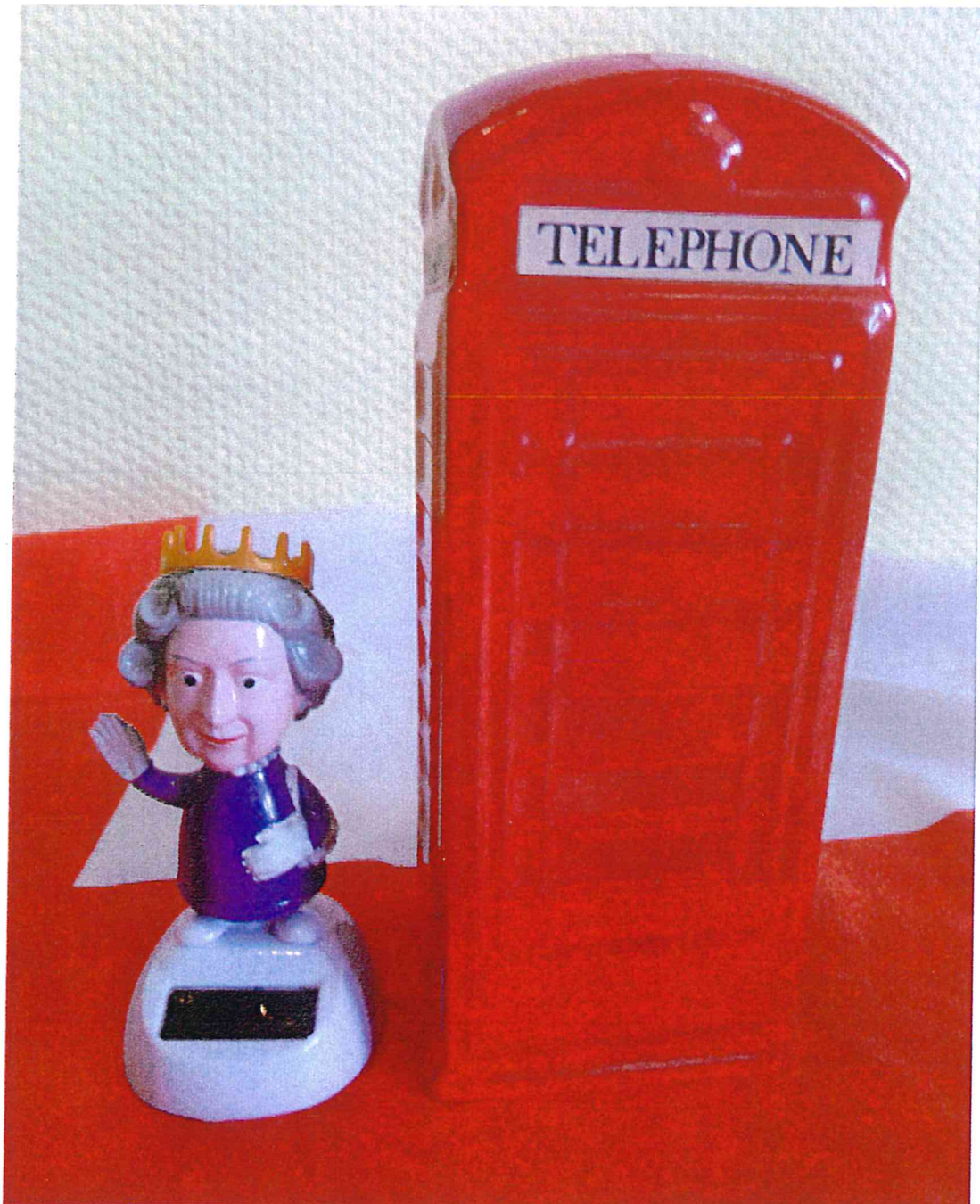
She is next to the call box.