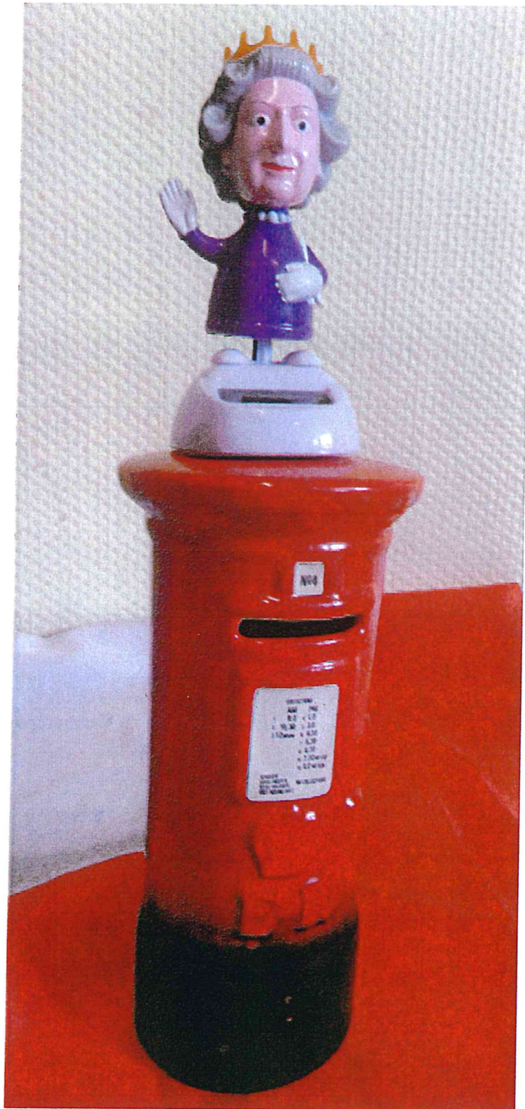
She is on the letter box.